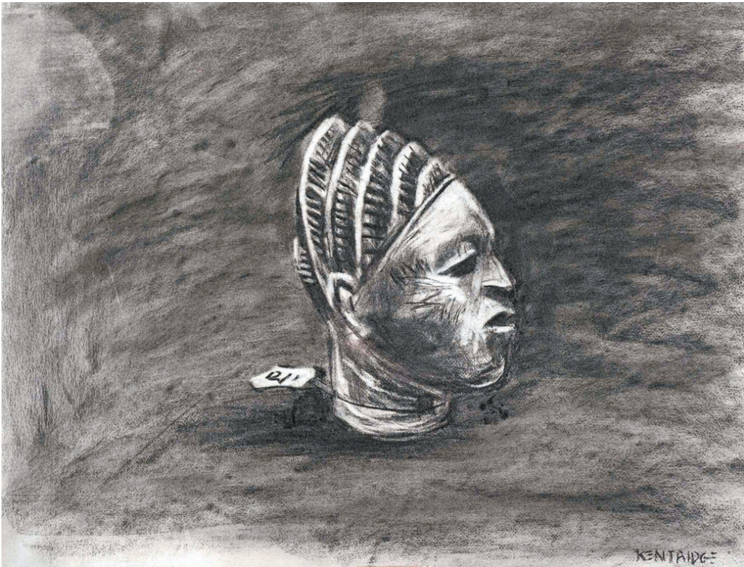
William Kentridge/Marian Goodman Gallery, New York, London, and Paris/Goodman Gallery, Johannesburg