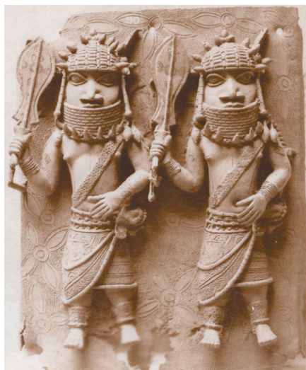
Study of a Benin Bronze plaque showing two officials with raised swords, Edo, Benin Kingdom, Nigeria, circa 1530–1570