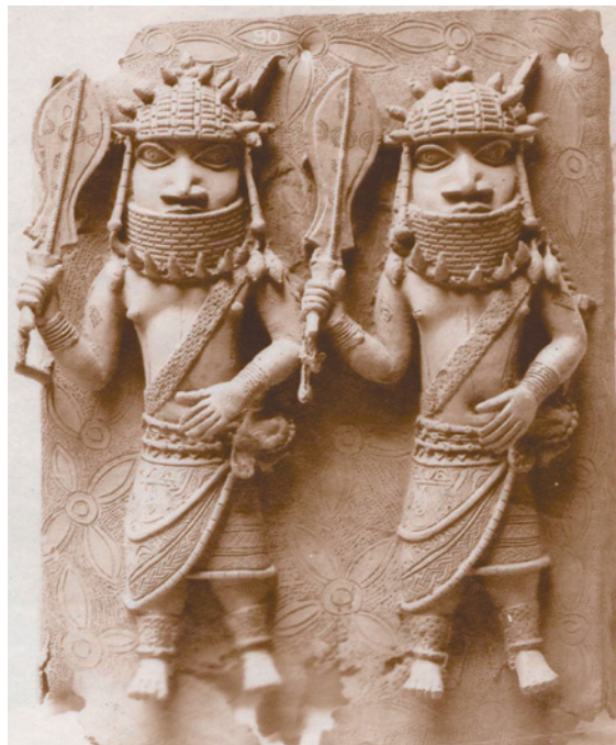
Study of a Benin Bronze plaque showing two officials with raised swords, Edo, Benin Kingdom, Nigeria, circa 1530–1570