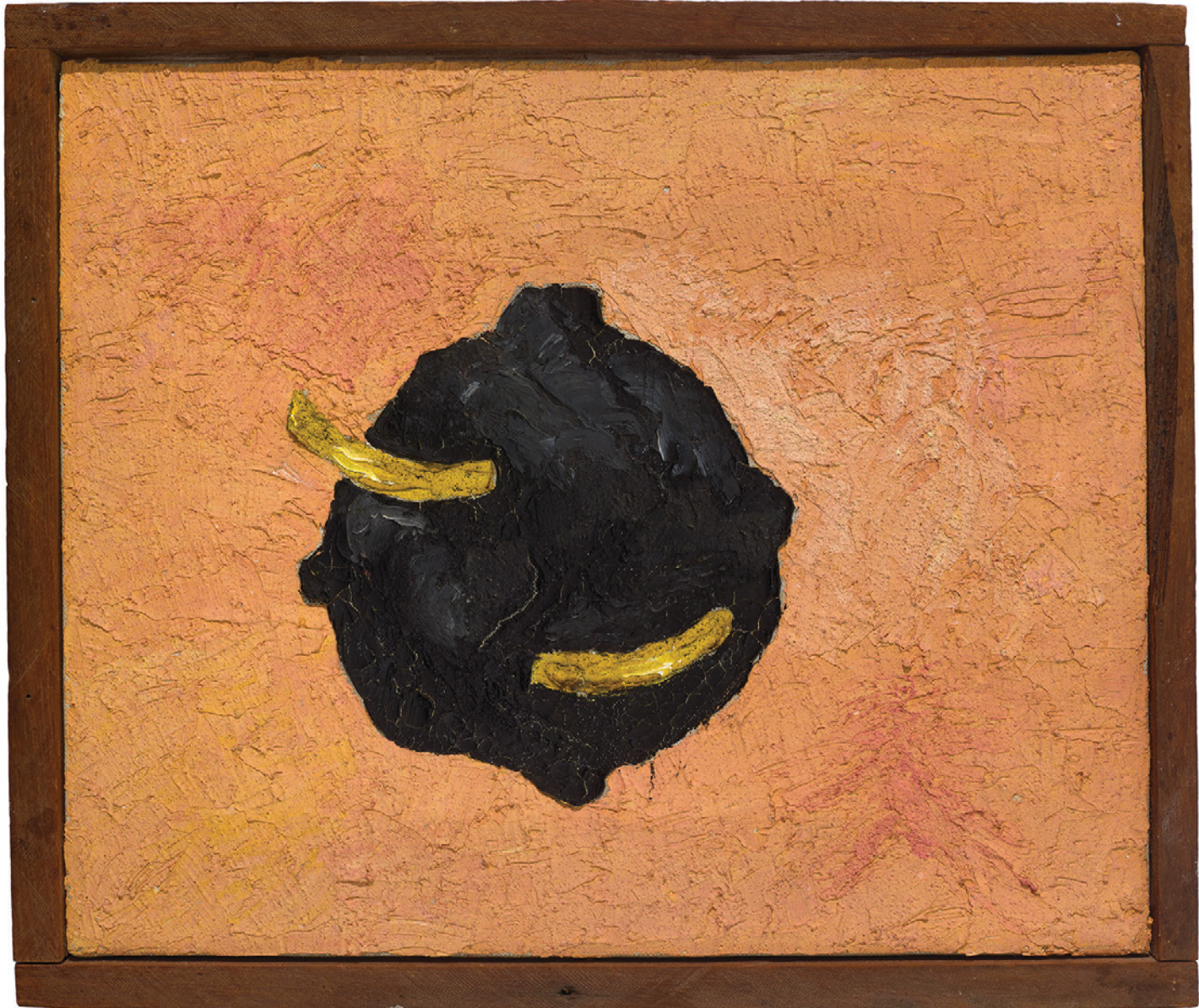
Forrest Bess Untitled #10, 1957 Oil on canvas 10 x 12 1/8 inches, 25.4 x 30.8 cm (canvas) 11 1/4 x 13 1/4 inches, 28.6 x 33.7 cm (framed)